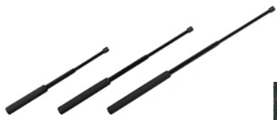
LeverLoc® Batons L16 L21 L26

Duty, SideBreak® and Federal® Scabbards retain retracted or expanded LeverLoc Batons.