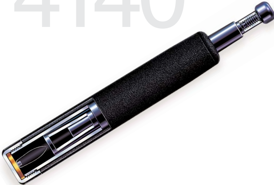
ASP 4140 v 4130 (Maximum Yield Strengths)